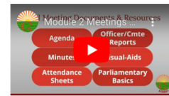
Module 2: Meetings and Committees