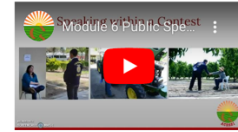
Module 6: Public Speaking