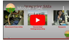
Module 7: SAE/Work Experience