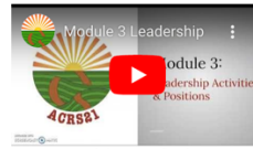
Module 3: Leadership