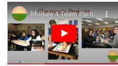
Module 4: Team Participation