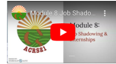
Module 8: Job Shadow/Internship