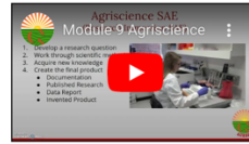
Module 9: AgriScience