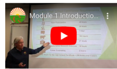
Module 1: Introduction

10 video training modules were created to assist and guide agriculture teachers through each component of the certificate program and its award requirements. The certificate award program, training modules, scholarship, and lesson plans are now integrated into the Agricultural Experience Tracker (AET).