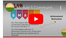
Module 5: Community Service